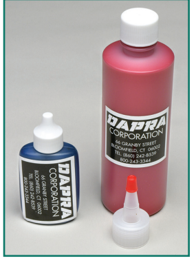
Water-Soluble Spotting Ink