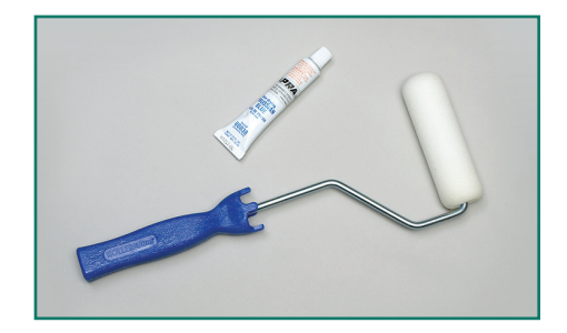
Prussian Blue and Spotting Ink Roller

66 Granby Street, Bloomfield, CT 06002 860-242-8539 | Fax: 860-242-3017