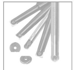
3D Finishing / Contour