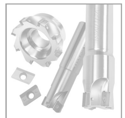
Square / Shoulder