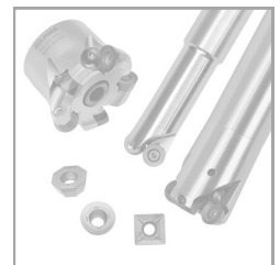
Copy / Face